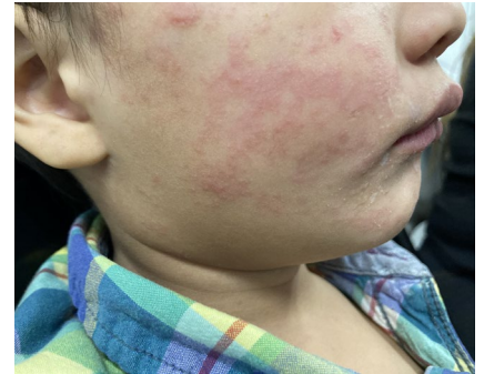
A child's cheek showing the characteristic measles rash.

Ensure specimen collection kits are not expired!