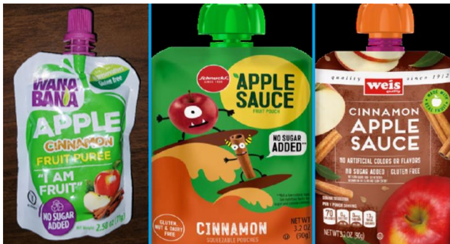
Center for Food Safety and Applied Nutrition. (n.d.). Investigation of elevated lead & Chromium levels: Cinnamon Applesauce . U.S. Food and Drug Administration. https://www.fda.gov/food/outbreaks-foodborne-illness/investigation-elevated-lead-chromium-levels-cinnamon-applesauce-pouches-november-2023

The investigation continued into 2024 and as of March 2024 there were 519 total cases that were broken down into confirmed (136), probable (345), and suspect cases (39), which spanned over 44 states including Texas. DSHS reported a total of 11 reports (5 confirmed, 6 probable). In April 2024, the FDA officially moved into the post-incident phase meaning the initial investigation is over and now the focus will be on surveillance, prevention, and compliance. The FDA will continue to evaluate future adverse events and conduct follow up as needed.