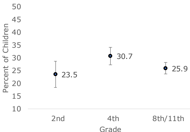
Figure 3: Percent of Texas school children who consumed sugary-sweet drinks* at least twice yesterday by grade, SPAN 2015-2016

Texas Department of State Health Services