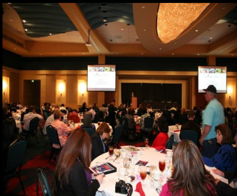
High Consequence Infectious Disease Response