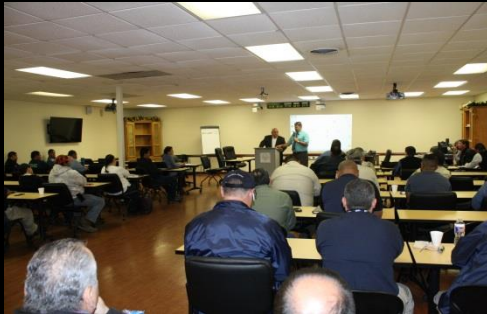
Multi-jurisdictional Vector Task Force Meetings