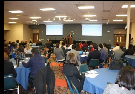
UTRGV & HCHHSD Disease Forum