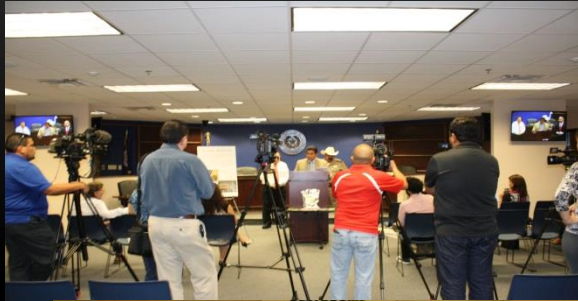
Raising Public Awareness