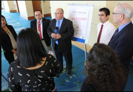
US – Mexico Binational Public Health & Arboviral Disease Forum