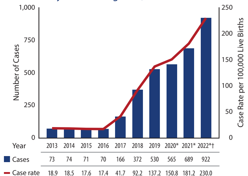
Figure 1: Texas Congenital Syphilis Cases and Rates by Year of Diagnosis, 2013-2022