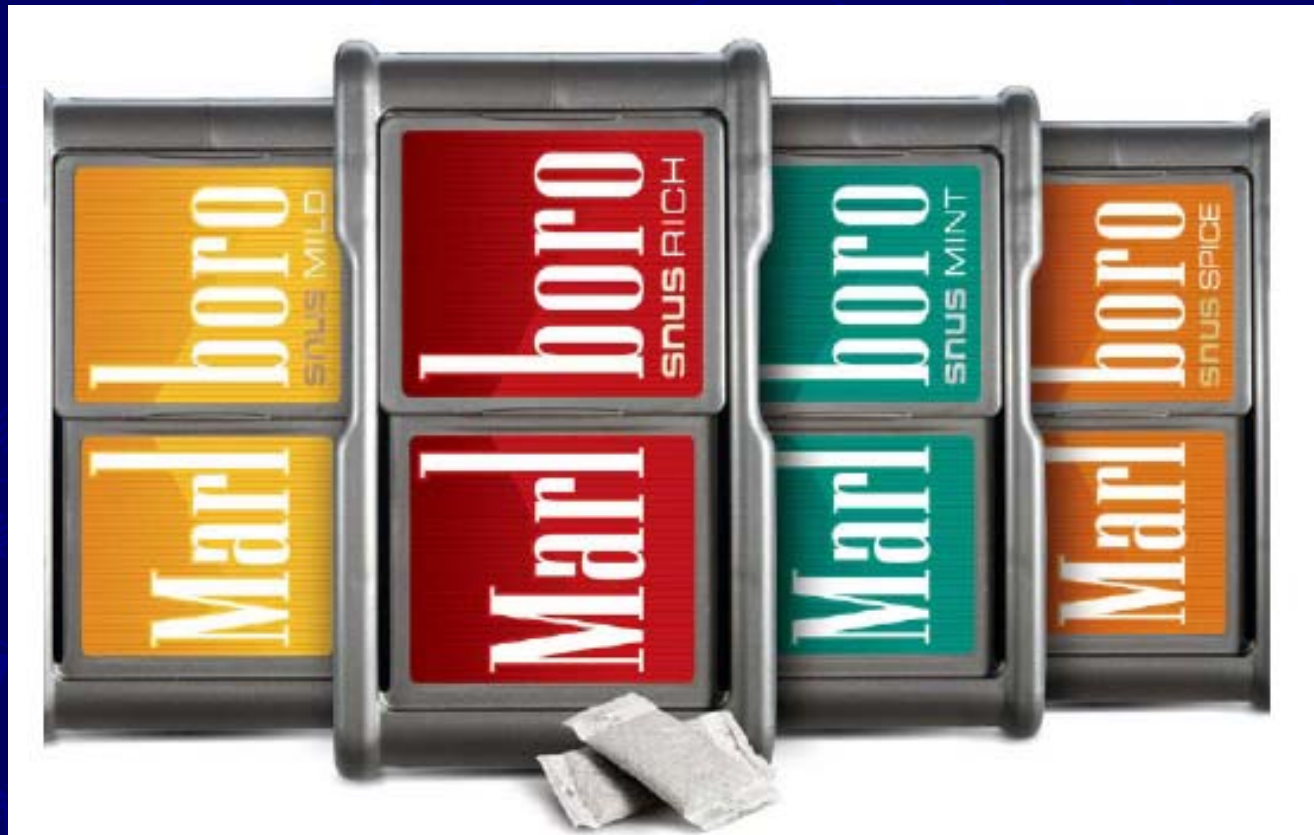
Marlboro Snus (PM USA)