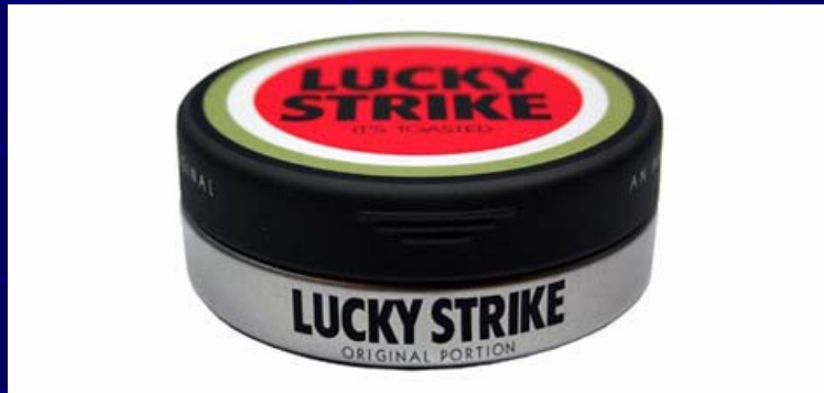
Lucky Strike Snus (BAT)