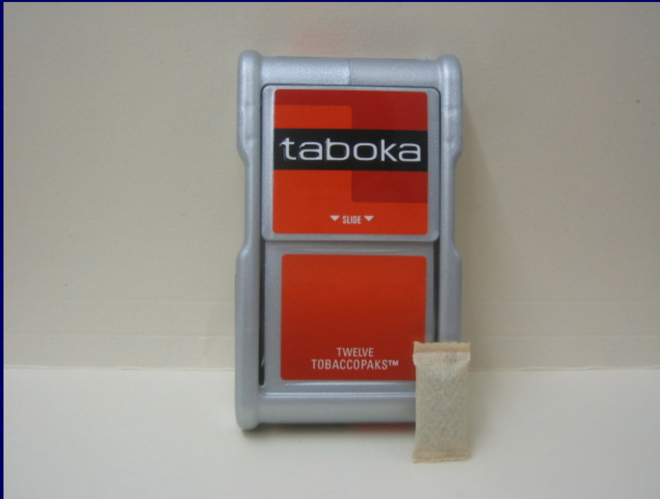
Taboka (PM USA)