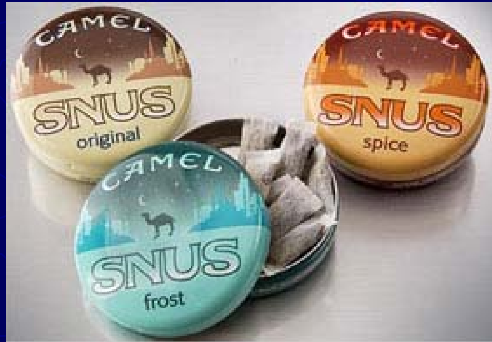
Camel Snus (Reynolds)