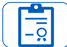
Audits and Quality Assurance