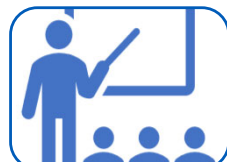
Education and Training